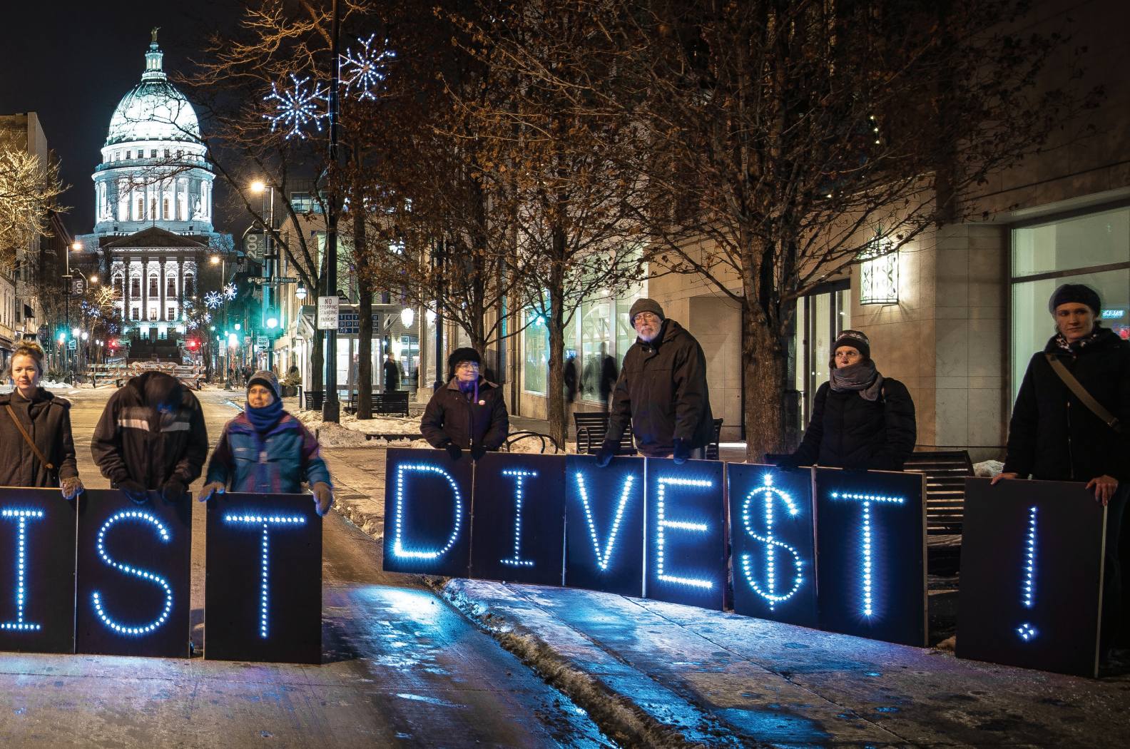
Activist group The Overpass Light Brigade poses at a Global Divestment Day event to promote divestment from fossil fuels on University of Wisconsin's campus in February 2014.

McKibben launched a campaign to get investors around the world to divest from the top 200 publicly traded fossil-fuel companies. The movement has evolved significantly since its launch in 2012—what began with universities, religious institutions, and philanthropic foundations now includes major capital cities, mainstream banks, insurance companies, and massive pension funds. Divestment pledges now span across 48 countries with over 70% of commitments outside the US, as of Fossil Free's latest report.