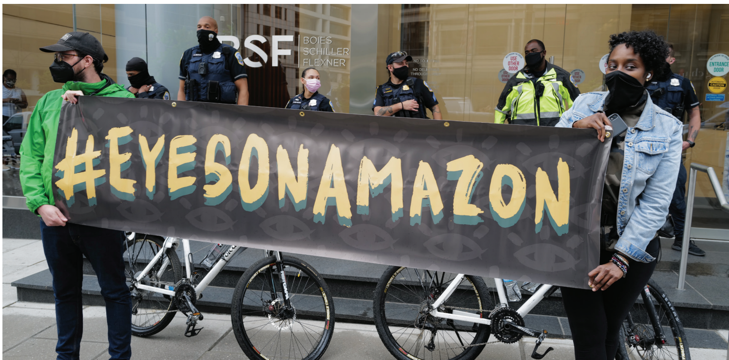
Protesters gather outside investors' offices in Washington, DC, ahead of Amazon's shareholder meeting in 2021.